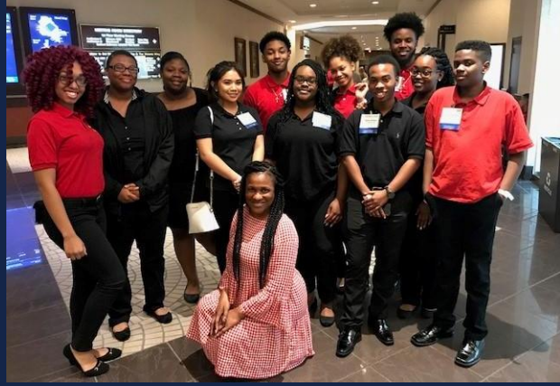
FCCLA students closing out a long day of competition.

FCCLA winners show off their Gold and First Place Medals.