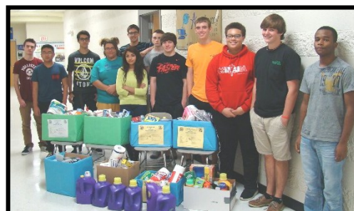
AOIT Non-Food Drive Work-based learning and community service activities are important elements of the academy program.